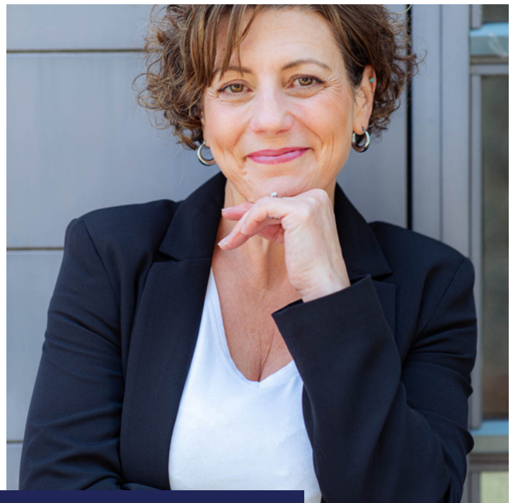
YOUR HR EXPERT

We offer a pay-as-you-go and retainer services with no long tie-in period.